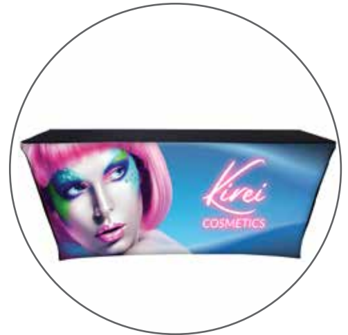
Qty.1 - 4 Sided Graphic w/ Full Color Front Side