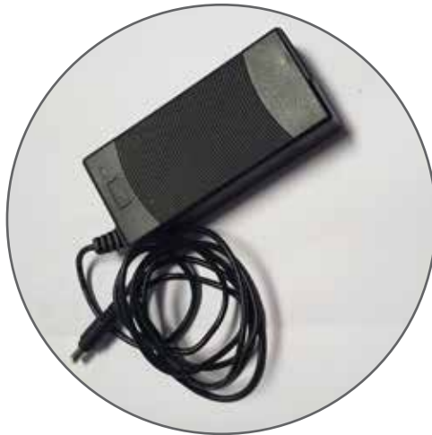
Qty.1 - AC Transformer