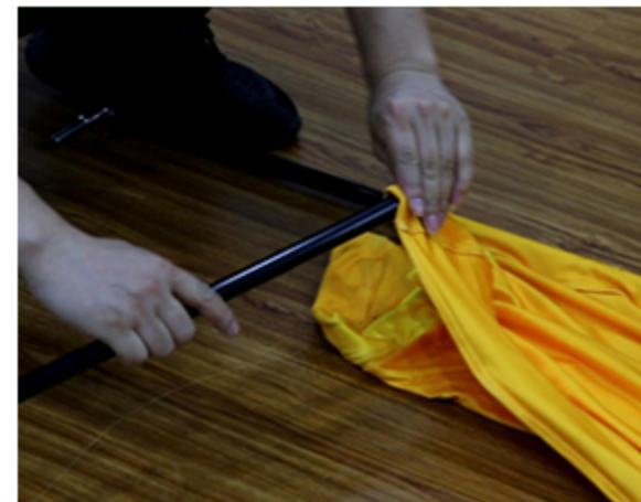
4 Then insert the rest 2 poles to the side pockets respectively