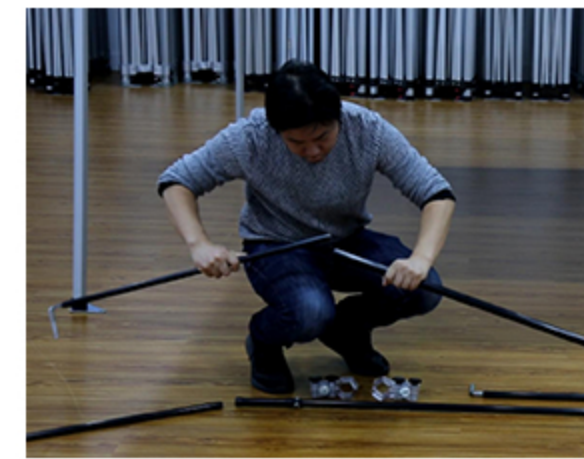
2 Connect one long tube with two short tubes to get a longest pole