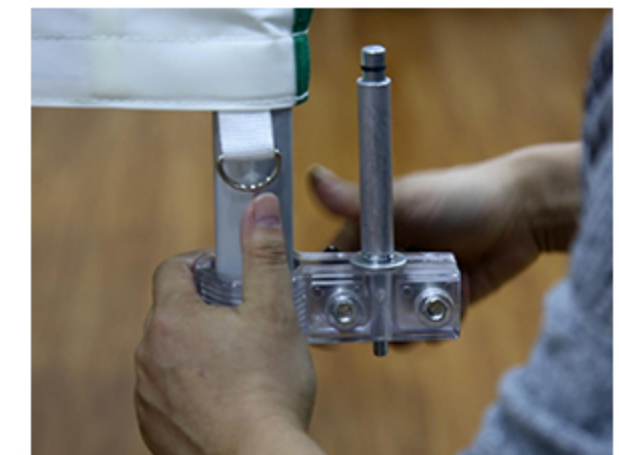
6 Attach the banner to the tent legs and then secure with the clamps