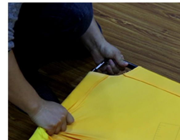
5 Use connectors to connect the horizontal pole and vertical poles