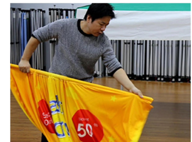
3 Insert the longest pole to the pocket first