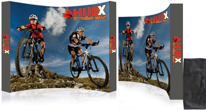
*Package includes padded nylon travel bag