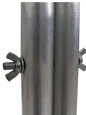
Screw and wingnut frame connection