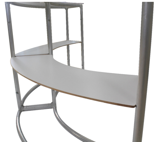
Shown with optional shelf