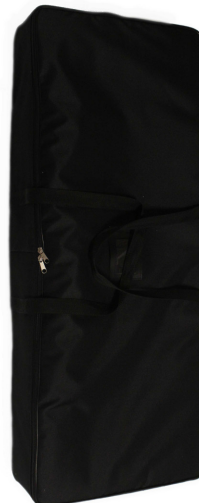
Black nylon travel bag