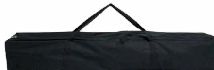
Nylon Travel Bag