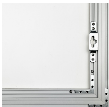
Wall Mount Holes on Backside of Frame Can Be Mounted Portrait or Landscape