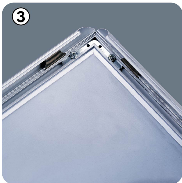
Place graphic onto frame