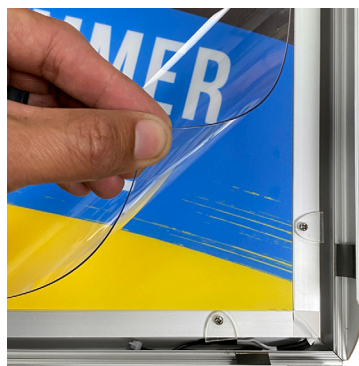
Anti Glare & UV Resistant PVC Protection Film