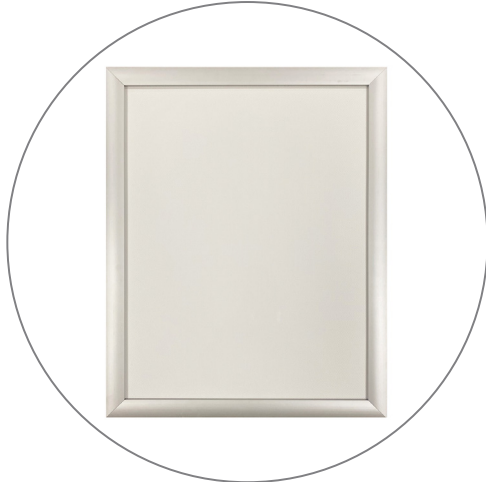
(qty 1) Snap Frame Backlit w/PVC Protection Film