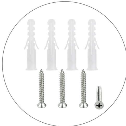
(qty 1) Hanging Hardware Kit Includes: (qty 4) Screws (qty 4) Wall Anchors