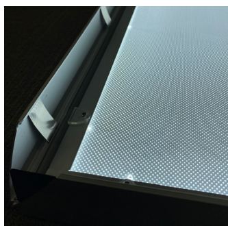
Acrylic Board with Laser Dotting Diffusion