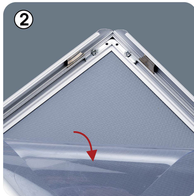
Remove PVC protection film