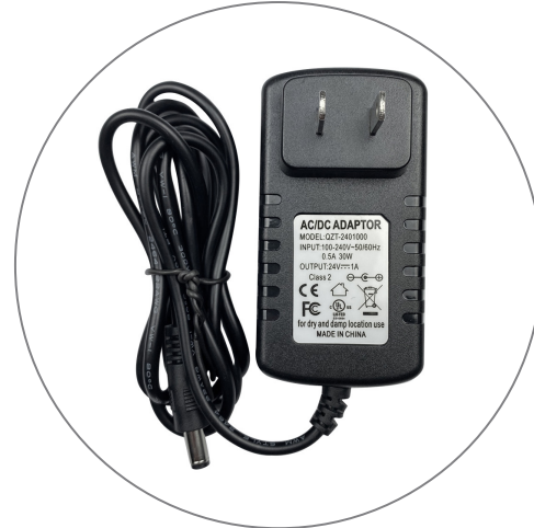
(qty 1) AC/DC Adaptor UL Listed