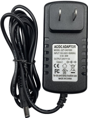
UL listed power supply