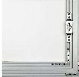
Wall mounts on backside