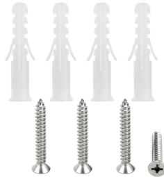
Wall mount hardware