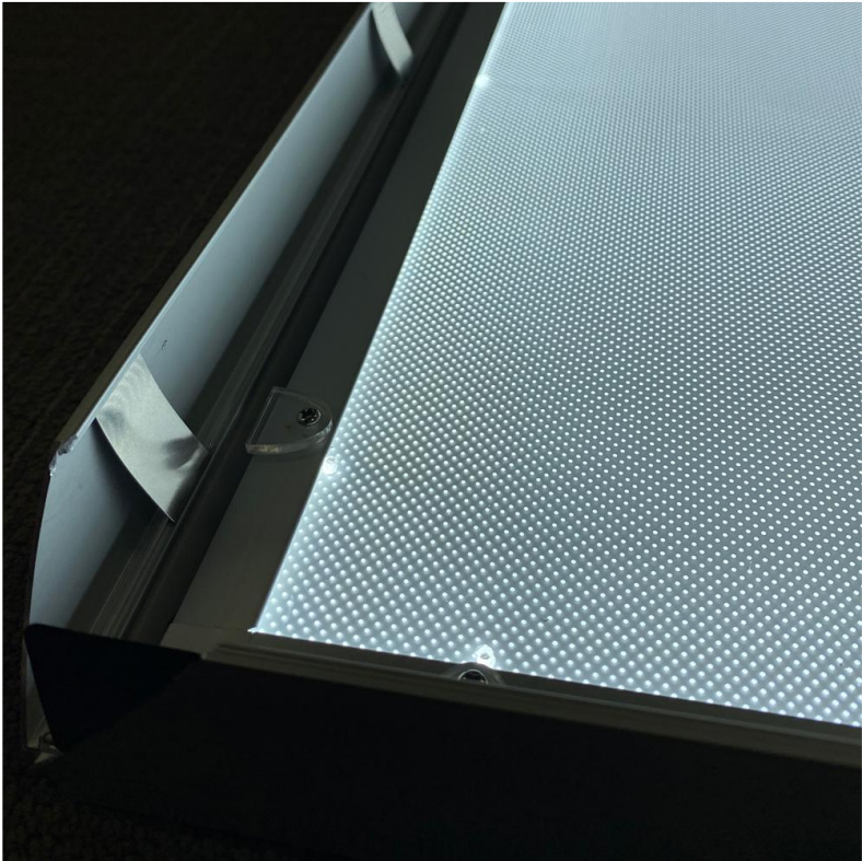
Laser dotted acrylic panel diffusion for even lighting