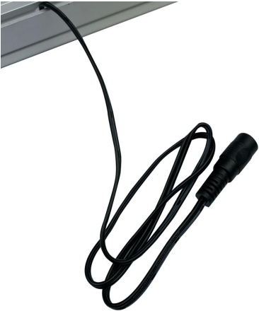
Power supply connection on short side of frame