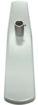
Tool Free Flat Feet (3.25in W x 16in L x 10mm H)