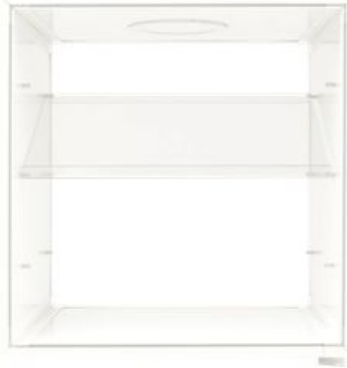
Tilt Middle Shelf