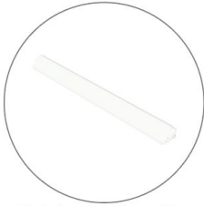
Qty 4 - 1 Section Channel Bars