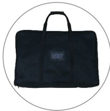
Qty 1 - Carry Bag