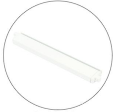
Qty 4 - End Cap Channel Bars