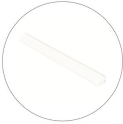
Qty 4 - 1 Section Channel Bars