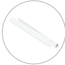
Qty 4 - 2 Section Channel Bars