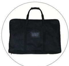
Qty 1 - Carry Bag