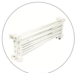
Qty 1 - Pop Up Frame