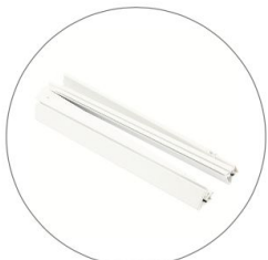
Qty 4 - 4 Section Channel Bars