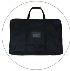
Qty 1 - Carry Bag