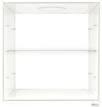
Flat Middle Shelf