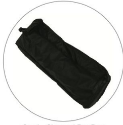
Qty 1 - Channel Bar Bag