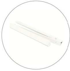
Qty 4 - 3 Section Channel Bars