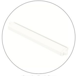
Qty 4 - End Cap Channel Bars