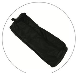
Qty 1 - Channel Bar Bag