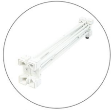
Qty 1 - Pop Up Frame