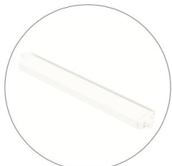
Qty 4 - End Cap Channel Bars