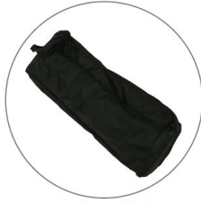
Qty 1 - Channel Bar Bag