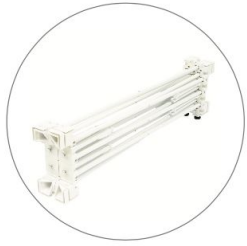
Qty 1 - Pop Up Frame