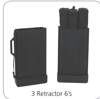
3 Retractor 6's