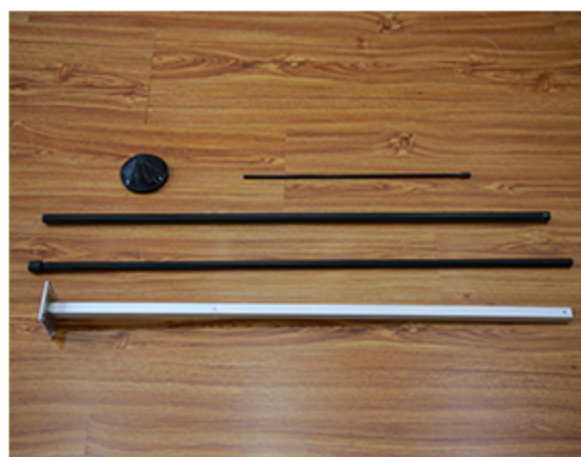
1 Lay all parts on floor

Tent - 10'x10' (40mm Hex) Peak Flag - 18"x59"