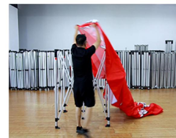
3 Unfold the tent frame and cover the tent top on it