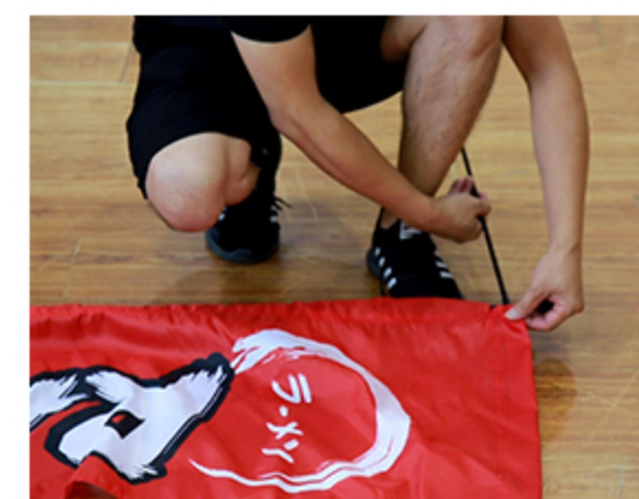
6 Insert the vertical pole into the side pole pocket, and the shorter pole the top pole pocket