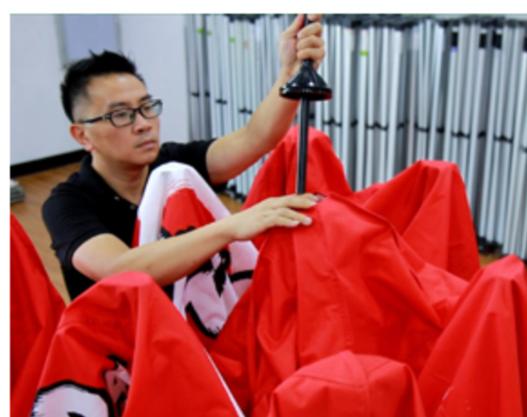
7 Mount flag on the top of the roof of tent and fasten with the plastic cap