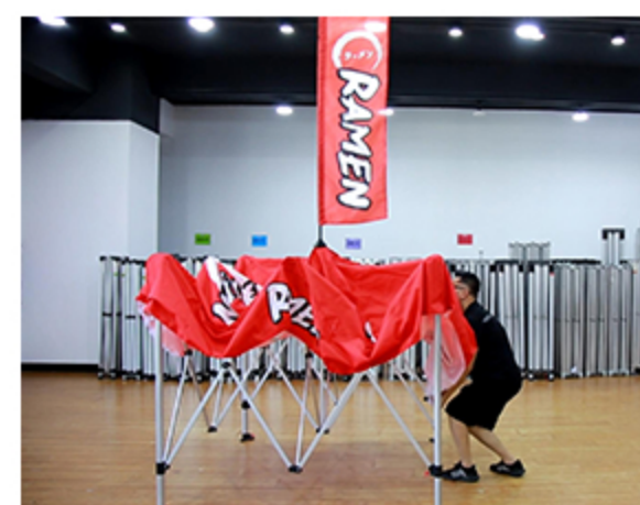
8 Adjust the tent to proper height