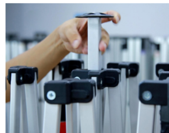
2 Remove the top pole from the tent frame first, then insert the supplied flag holder