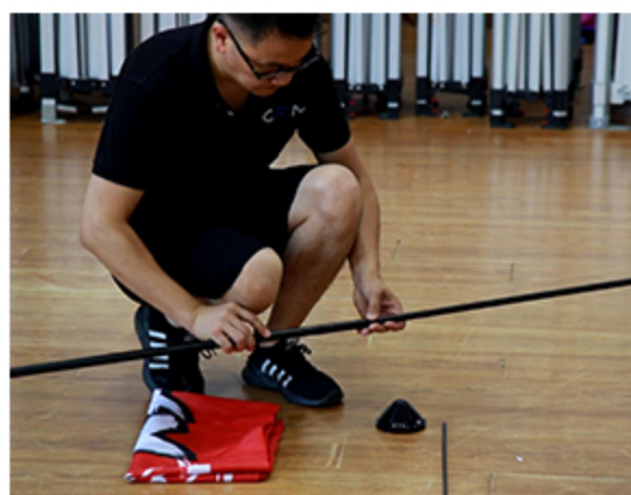
4 Connect the 2 long tubes to get a vertical flag pole