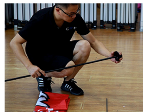
5 Insert the plastic cap onto the pole