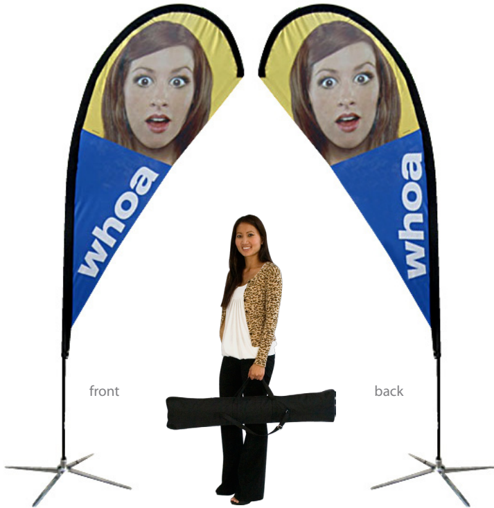
Feather / Teardrop banner stands size comparison